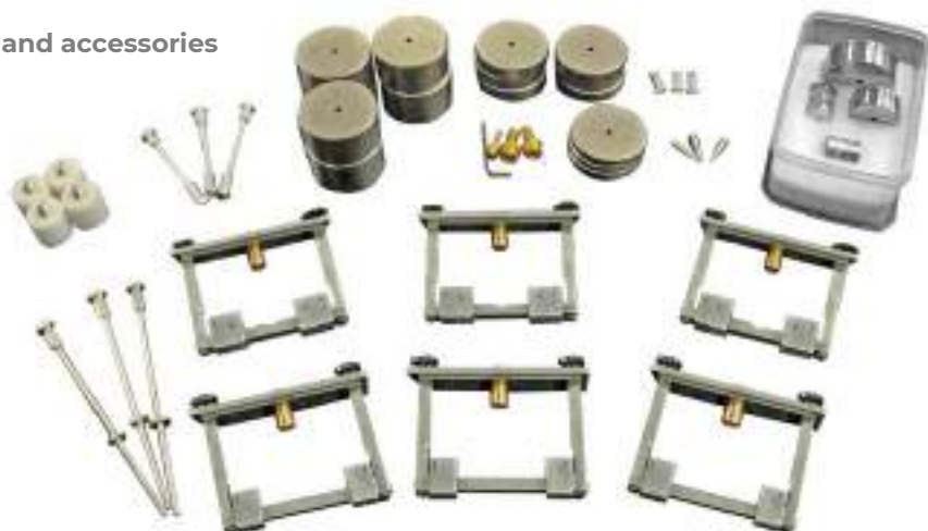
Testing tools and accessories